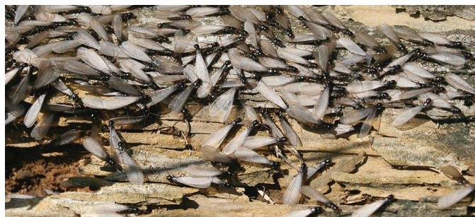
Swarm of winged termites, a sure sign there is a mature colony in your area.